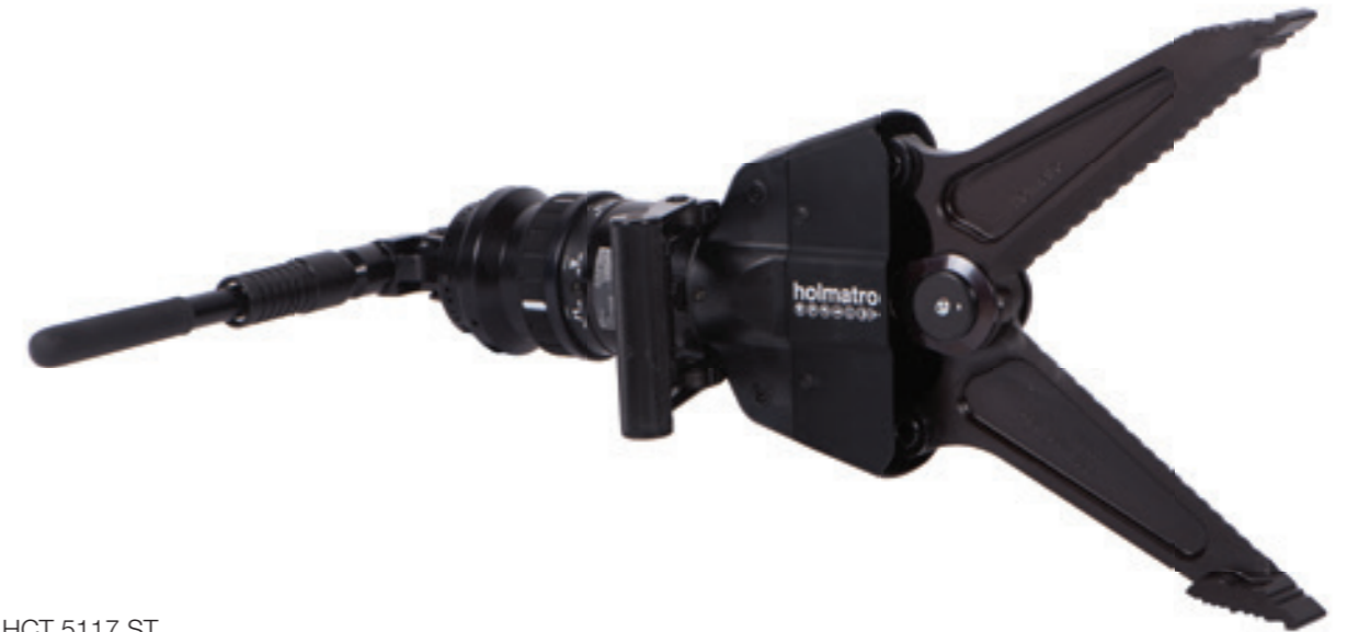
HCT 5117 ST