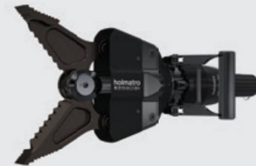
CT 5111 ST

The backpack pump can also drive other Holmatro Special Tactics CORE Tools, such as the compact and lightweight combi tools CT 5111 ST