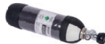
Air Bottle HAB 01 ST

* meets bullet test according to EN 12245