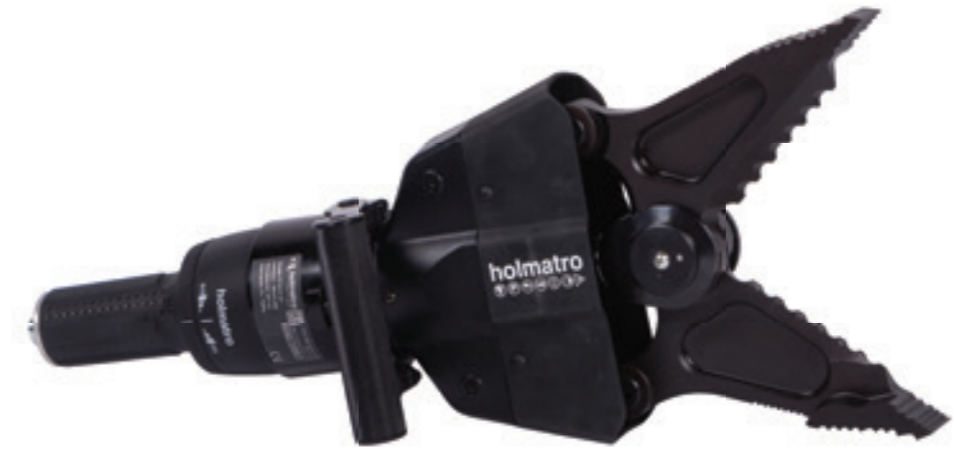
CT 5111 ST