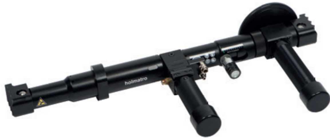
HDB 90 ST