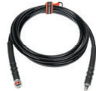
C 1.5 ZU (for specifications see page 26)