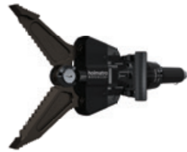
CT 5114 ST