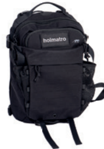
Backpack Pump GBP10EVO3