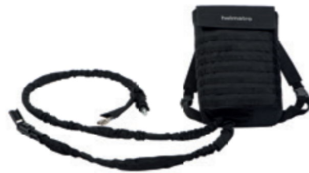
HDB P 240 ST (WO)

To be used in combination with one of the Door Blaster Packs.