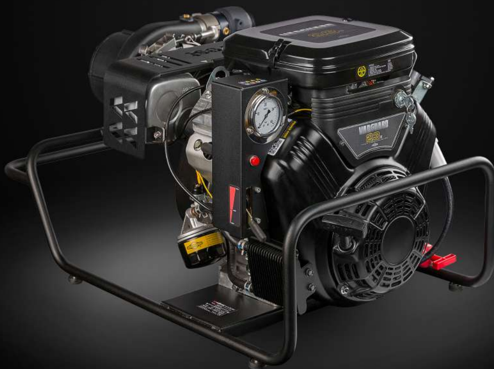
Black Hawk BH4-18